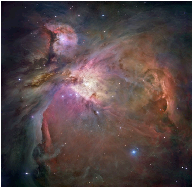
Figure 1. The Great nebula in Orion